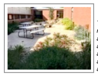
The plants have matured and there are many insects and plants to study and enjoy. Fish and amphibians are next.

The courtyards have matured significantly over the last year and the students are seeing some of the fruits of their labor. The space has provided some great learning opportunities!